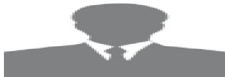
Photo (<50kb jpg. jpeg)